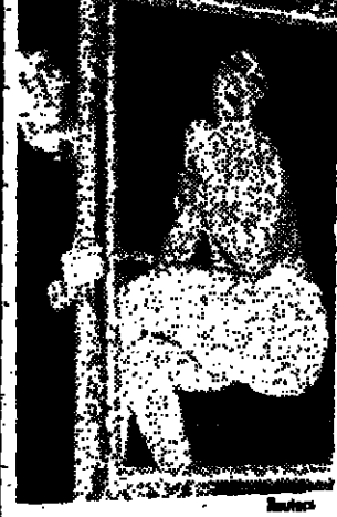
"La Belle Romaine" on display Friday in Paris.

GENEVA — United Nations economists said Friday that the world risks a recession if cuts in the U.S. budget deficit are not combined with moves by Japan and West Germany to increase demand for goods in their economies.